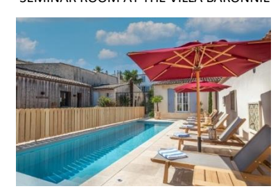
HEATED OUTDOOR SWIMMING POOL