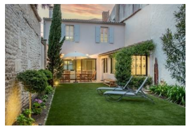
LA VILLA BARONNIE